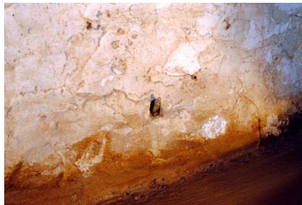
Packer is set in place