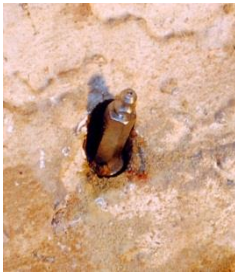
This shows the correct way to set a packer for injection