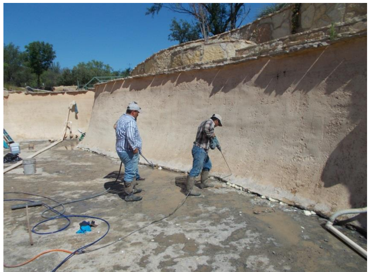
Fig 3: Drilling 5/8” holes for injection packers, Notice the oakum and SealGuard II used to chink the floor/wall gap.