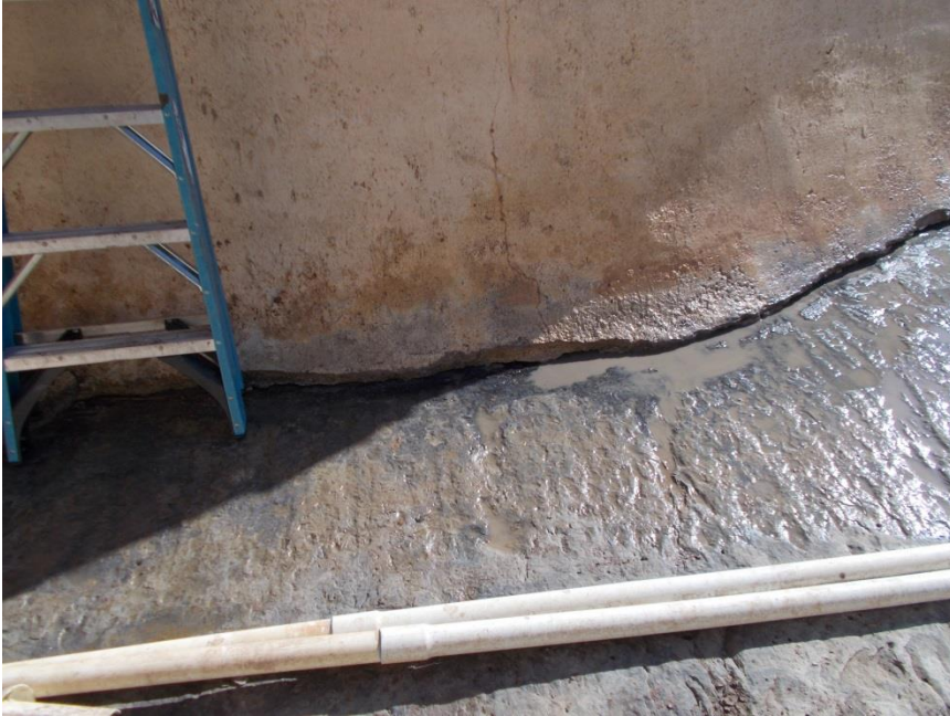
Fig 2: This photo shows how the gunnite has shrunken from the bedrock floor.

This led to the loss of thousands of gallons per day when full and allowed large amounts of fine, silty clay to enter the pool in high rain events. It also caused significant voids behind the wall which we discovered when drilling our injection holes