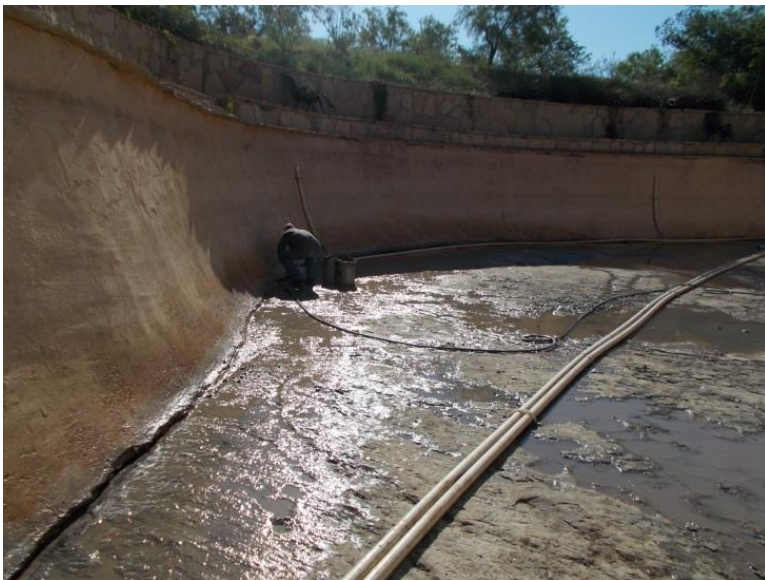
Fig 1: The Subject Pool, as the gap between the wall and floor is cleaned with a high pressure water stream and loose debris removed.

SealGuard was approached by the general manager of a 3,500 acre game preserve in the center of Texas to provide technical assistance and material to fix a large partially natural swimming pool. It was suffering from both heavy outflow when full and heavy inflow of dirty groundwater during torrential rain events. (There is an old saying in Texas: “We get 24” of rain per year and you should be here the day we get it”)